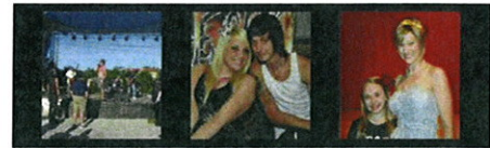
Christmas in July

Featured Photos - 9 total ( Expand View ) next »